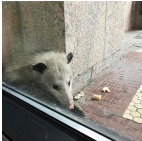
Bossett, as he sought shelter down a city street, before his rescue.

When working with injured, ill, or recuperating Virginia opossums, a functional kennel is often a necessity. Wire kennels are collapsible, portable, and relatively inexpensive, making them a popular choice for rehabilitators. While it is an unfortunate truth that equipment designed for native wild species is nearly nonexistent, it is important to note that domestic species like dogs have drastically different biology, behavior, and husbandry requirements than wildlife such as the opossum. Therefore, the use of canine-approved kennels for the housing and transportation needs of opossums is sometimes inadvisable.